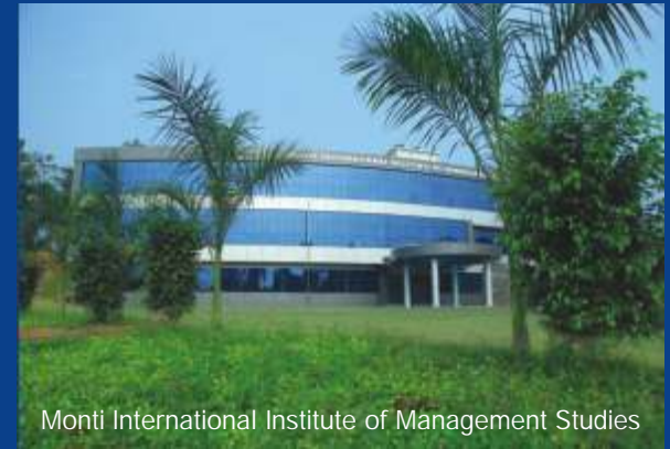
Monti International Institute of Management Studies